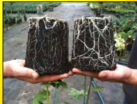
Other leading potting mix (left); Koy-Logic (right).

Competitively priced and cost effective.