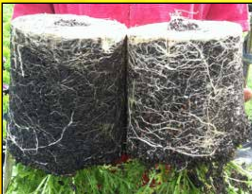
Other leading potting mix (left); Koy-Logic (right).