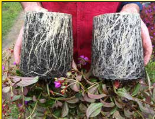
Other leading potting mix (left); Koy-Logic (right).