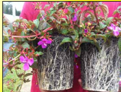
Other leading potting mix (left); Koy-Logic (right).